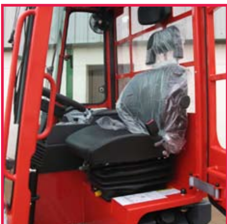
Deep Suspension Seat