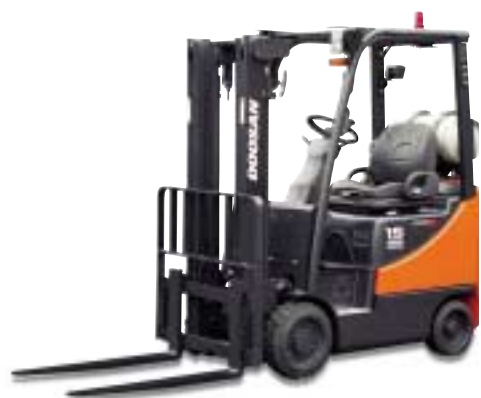
GC15S/GC18S-5 & GC20SC-5 1500kg, 1750kg, 2000kg Cushion Tire