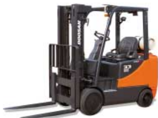
GC20E/GC25E/GC30E/GC33E-5 GC20P/GC25P/GC30P/GC33P-5 2000Kg, 2500kg, 3000kg Cushion Tire